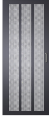
Single Perforated Door