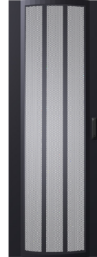
Single Curved Perforated Door