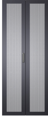
Double Perforated Door