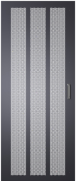
Single Perforated Door